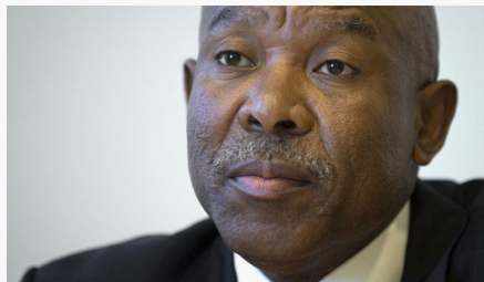
The central Bank and National Treasury are in active talks to help stem the tide of South Africa's growing budget deficit.